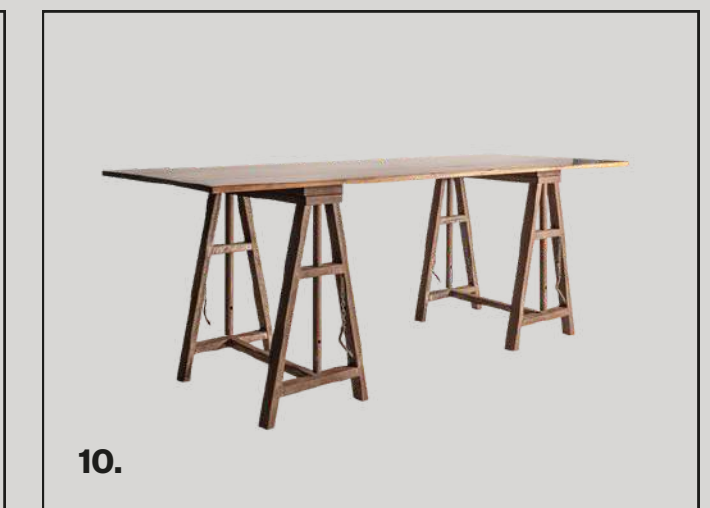
1. Swedish High Table 60Ø – 2. Black Curved Niza Table – 3. Suecia High Table – 4. Round Rustic Table – 5. White Suecia Table – 6. Rustic Table – 7. Niza Rustic High Table – 8. Finland White Stool – 9. Finland White-Wood Table 70*70 – 10. Trestle Table