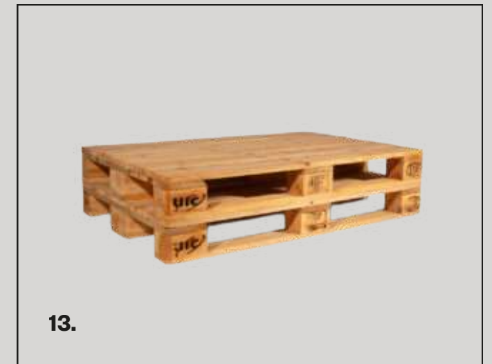
1. Bali Armchair – 2. Wicker Armchair – 3. Premium Rope Armchair – 4. Low Java Wood Table – 5. Maldives Armchair – 6. Java Table – 7. Waikiki Wood Table – 8. Mesa Madera Waikiki Ø – 9. Elongated Waikiki Table – 10. Industrial Wooden Small Table 3u – 11. Kram Rustic Table – 12. Low Java Table – 13. Pallet Table