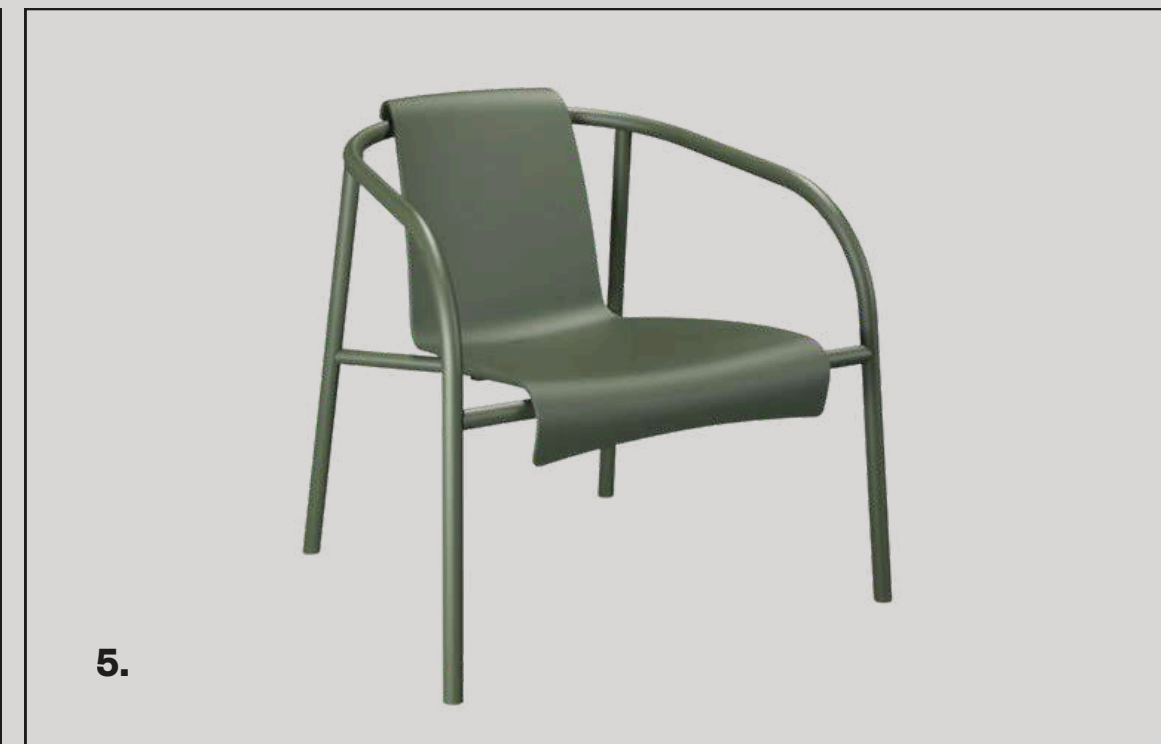
1. Light Green Ribbed Chair - 2. Blue Ribbed Chair - 3. Dark Blue Ribbed Chair - 4. Dark Green Ribbed Chair - 5. Recovery Armchair